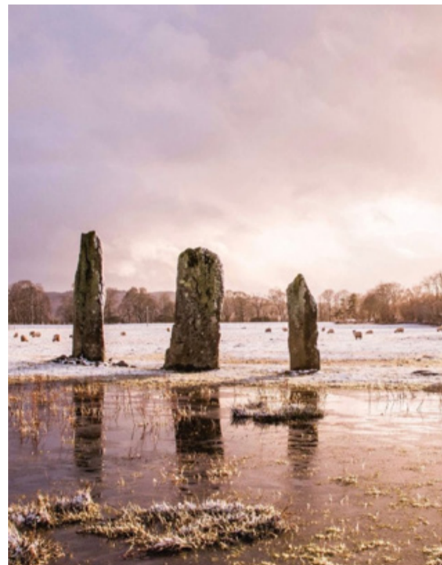
From Left to right. Glenevedale House Port Ellen, Isler of Islay Kilmartin Glen